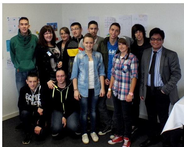
Polish students and Spanish trainees