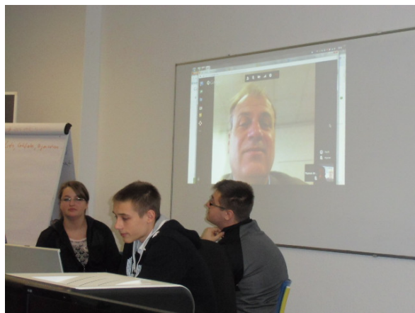
Polish students show ‚Google Hangouts‘